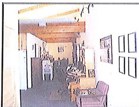
Open Beam Ceilings