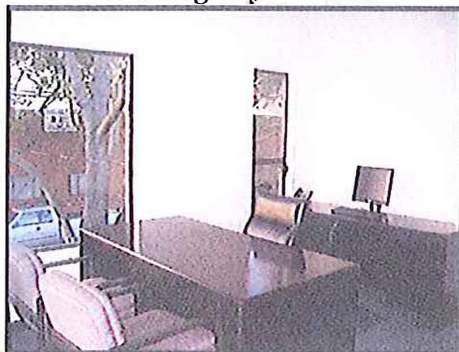
Private Office #1